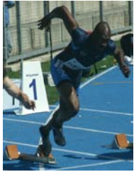
Coach Dixon World Masters Italy 07