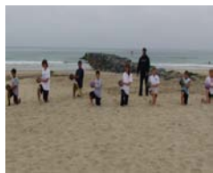
Beach Runs 2010