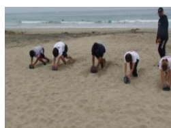
Beach Runs 2010