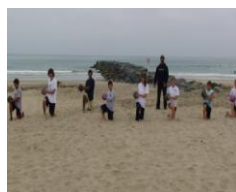
Beach Runs 2010