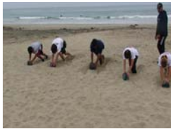
Beach Runs 2010