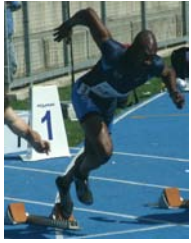
Coach Dixon World Masters Italy 07